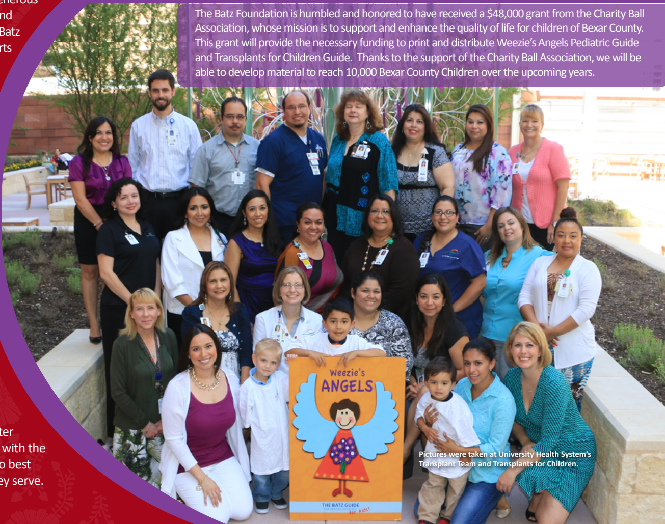
Pictures were taken at University Health System's Transplant Team and Transplants for Children.